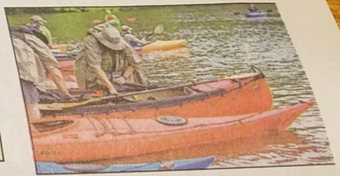
A woman prepares her canoe for the river.